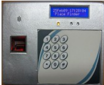
(The 1:1 Finger Print Reader)