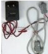
(Power Adapter for without access control)